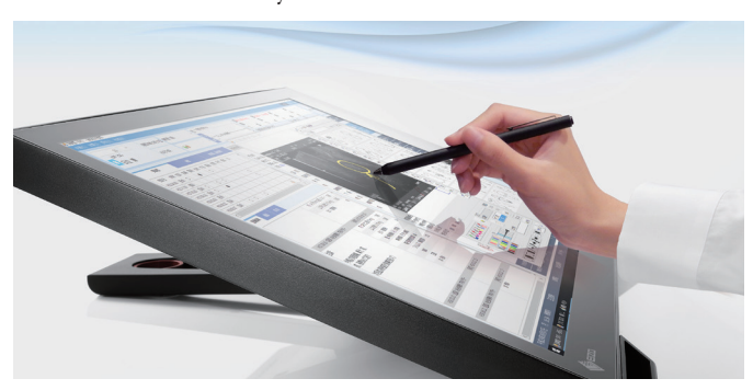
EIZO ensures customer peace-of-mind by performing comprehensive compatibility testing. See what commercially available stylus pens are proven to be compatible: www.eizoglobal.com/i/stylus/

The MS236WT features projected capacitive touch technology which is more reliable compared to other touch technologies, allowing for drag and flick finger operations to be smooth. In addition to the supplied passive touch pen, the monitor also accepts input from commercially available active stylus pens, so small and detailed letters can easily be written into a medical record.