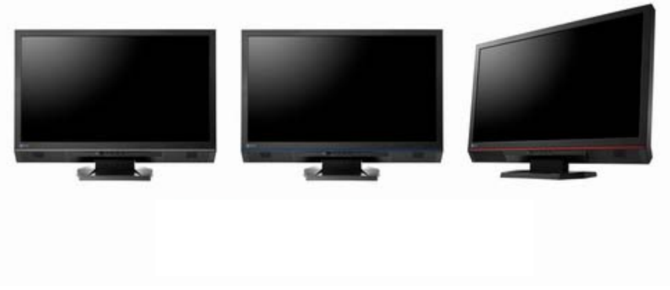
FORIS FS2331 monitor equipped with PowerGamma

However, since gamma correction applies tone conversions to all tones equally, the local contrast of outlines and textures may decrease. This can cause gamma correction to create an impression differing from the texture of the original image. Also, as gamma correction is not suitable for some kinds of images, we provide the PowerGamma setting for games only.