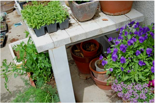
Image corrected by Smart Insight The shadow of table is close to its actual color.

The reason for such low visibility in the dark area is because the brightness of the monitor output is significantly darker than real-life. For example, the luminance in mid-summer is approximately 100,000 lx in the sun and 10,000 lx in the shade. However, the maximum luminance of general monitors is several hundred cd/m<sup>2</sup> and the minimum is close to zero. Although the units between the luminescent and illuminated sides differ, the brightness of what we see is significantly different between the monitor and the real thing. In short, the monitor can brighten the low tone areas (a few cd/m<sup>2</sup> on the screen) in the photograph of a subject that is 10,000 lx luminance in the shade.