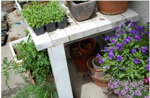
Original image with a camera The shadow of the table looks darker than its actual color.

When we photograph subjects with a significant difference between backlighting and shadow, images shown on the monitor could sometimes be dark and hardly visible. We can prevent this type of phenomenon to some extent by adjusting the exposure on the camera. However, exposure adjustment usually applies to the whole screen so lengthening exposure time may cause the saturation of bright areas, making the images hardly visible.