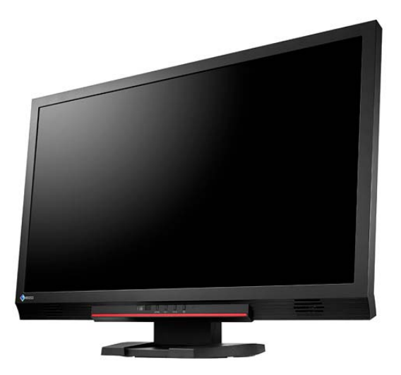
FORIS FS2333 monitor equipped with Smart Insight

To solve this problem, we developed Smart Insight, which improves visibility in dark areas and suits user preferences (details described in this document.) This function improves visibility in dark areas while retaining the original texture of the image source and provides visibility that emulates how things appear in the real world. In addition, Smart Insight includes the concept of "natural comfort" and provides newly added value based on the concept, "make the scene come alive" which means to accurately reproduce real-world images on the monitor.