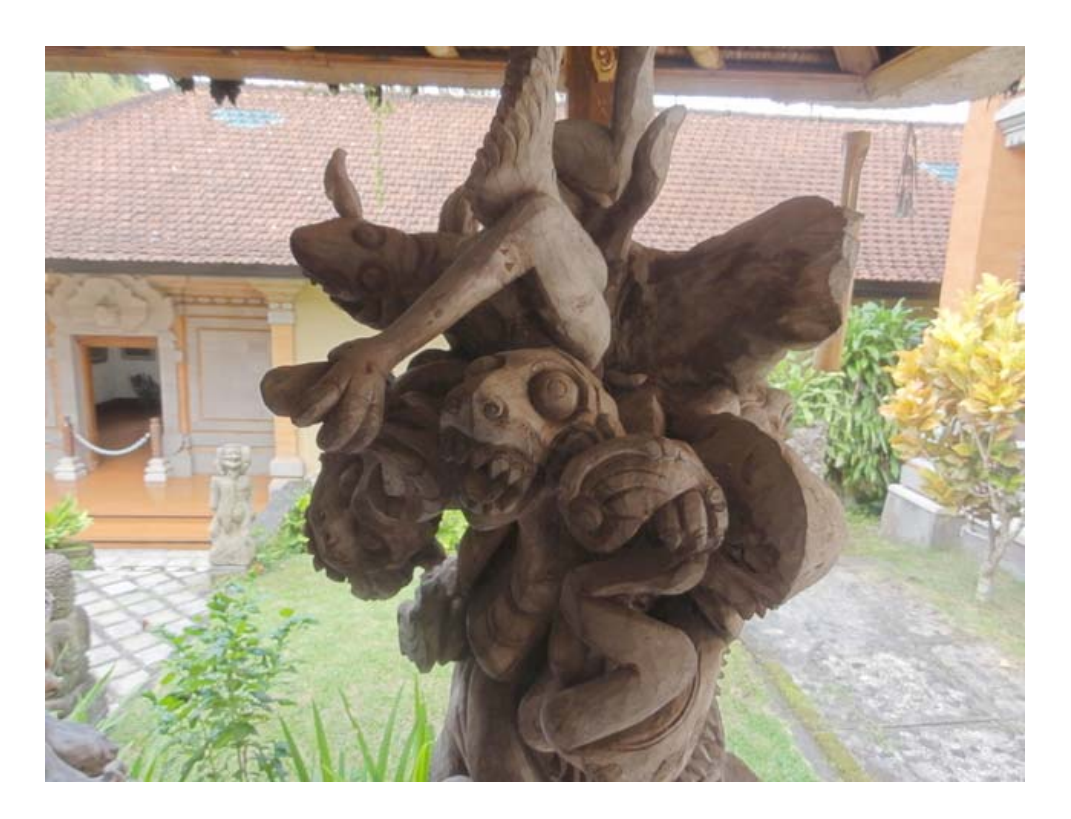
Gamma correction y=1.6

Gamma correction can improve visibility of the dark area, however, since gamma correction converts all tones equally, local contrast decreases and outlines becomes blurred. Also, the entire image becomes whitish from the loss of vividness.